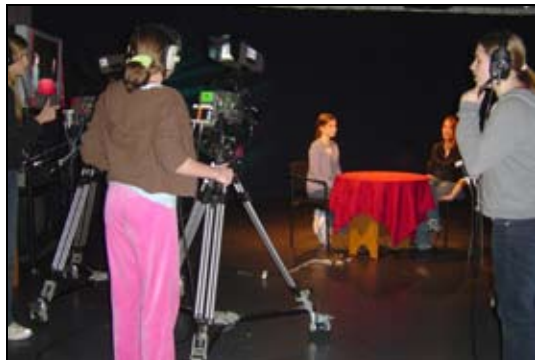
Girls from Expand Your Horizons , a science and technology job fair for middle school girls, learn about television production. They rotated studio positions so everyone worked in front of and behind the cameras.