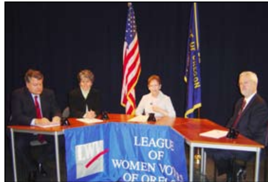
Candidates for the Oregon Supreme Court wait for the cue from the floor director.