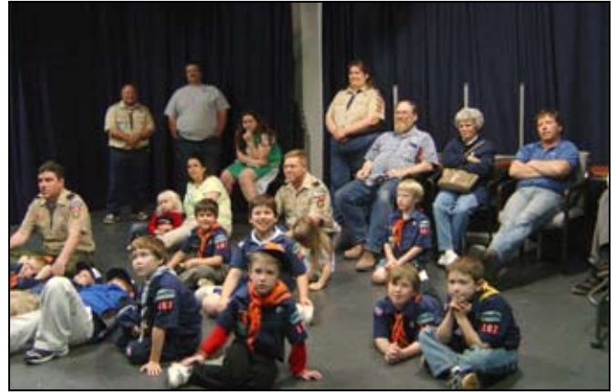
These scouts from Pack 107 are on a Media Literacy Visit at CCTV to earn their communication badges.