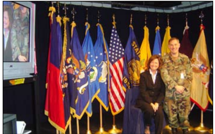
CCTV has had a long friendship with the Oregon National Guard and has helped create several public service messages celebrating the Guard's work.