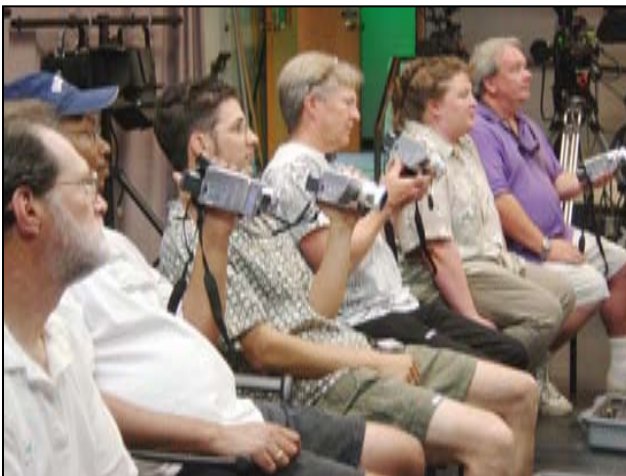
Experienced community producers learn how to operate a new hand-held camcorder, the Panasonic GS400.