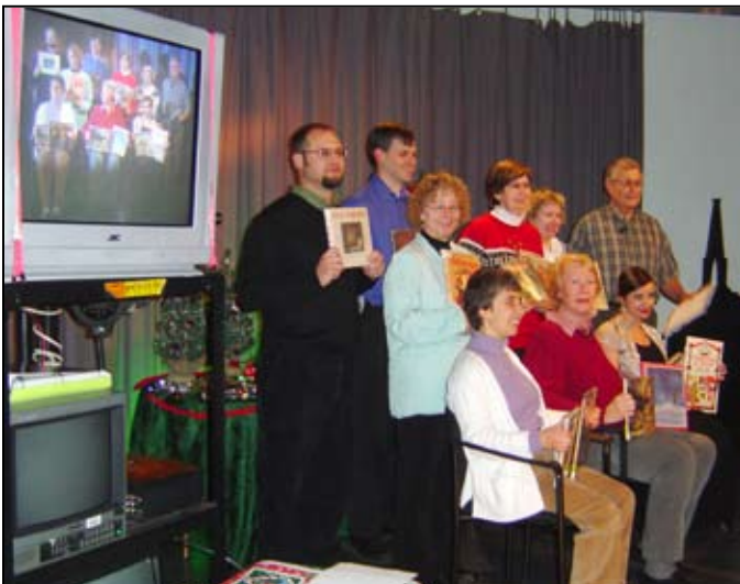
Salem Public Library staff encourages everyone to read in their holiday greeting.